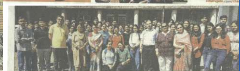
पीयू में शैक्षिक दौरे के दौरान मौजूद डीएवी के विद्यार्थी।