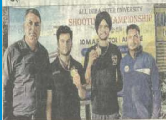
प्रतिस्पर्धा के दौरान पदक जीतने वाले शूटिंग के खिलाड़ी।

चंडीगढ़। ऑल इंडिया इंटर यूनिवर्सिटी शूटिंग चैंपियनशिप में पंजाब यूनिवर्सिटी के शूटर्स ने बेहतरीन प्रदर्शन करते हुए दो स्वर्ण पदक हासिल किए।